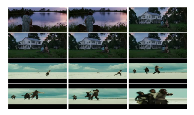
Figure 4: Two samples of frame sequences from the Hollywood2 dataset. The first sequence (row 1 and 2) belongs to the class of sitting down; the second sequence (row 3 and 4) has two labels: running and fighting person.

than one label (multi-class multi-label problem) we implement a logistic activated classifier for each class on top of the last hidden layer. Following (Marszałek et al., 2009) we measure the performances using Mean Average Precision across all classes, which corresponds to the Area-Under-Precision-Recall-Curve.